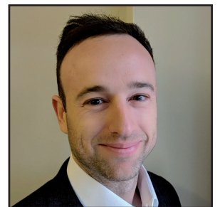
Avidan Last Investment Adviser